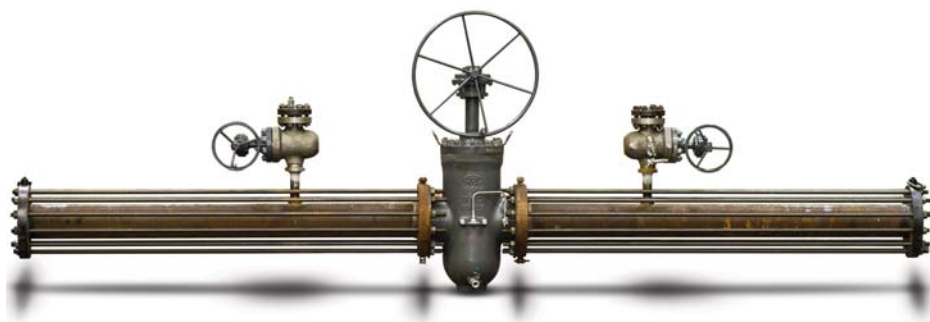
Size: 8", Class: 900 SCV API 6D Thru Conduit Valve (Expanding Gate Design) modified with by-pass ventilation assembly, pipe pups, and twin bypass 2" – 1500 Thru Conduit Gates (Expanding Gate Designs) (flanged for testing).