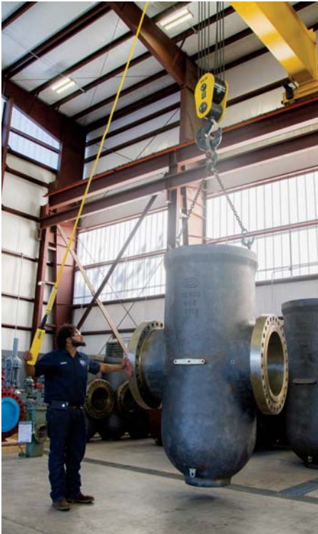
Moving 30” 600 Thru Conduit casting into position for assembly.

We have broken ground on Phase II, a 13,000 square foot shipping and receiving pavilion, complete with 3 truck wells and a crane bridge. Phase III, will consist of a 20,000 square foot finished-inventory warehouse.