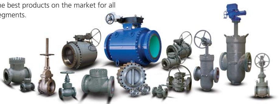
The SCV valve family: Piston Checks, Full Port Swing Checks, 3-Piece Trunnion Mounted Balls, Wedge Gates, Globes, Lubricated Plugs, Dual Plate Checks, Thru Conduit Gates, & Rising Stem Balls.

SCV Valve’s midstream product line (API 6D trunnion mounted ball valves, thru conduit gate valves - slab and expanding gate, full port swing check and piston check valves, and lubricated plug valves) has always been our bestselling line. However, given the location of our facilities and distribution network, the upstream and downstream markets have offered avenues into comparable product lines that allow us to utilize our design capacities and manufacturing philosophies to provide the best products on the market for all segments.