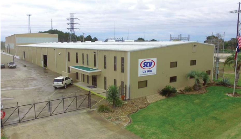
SCV Valve manufacturing facility in Santa Fe, TX.

A lot of manufacturers source materials globally, but SCV Valve takes supply chain partnerships a few steps further by