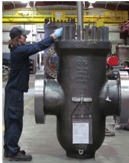
Assembly of 16-3/4” – 5000 PSI SCV API 6A Thru Conduit Gate Valve (Expanding Gate Design).

Absolutely! One design specifically SCV Valve manufactures is the large-bore API 6A Thru Conduit Gate Valve in sizes 9”, 11”, 13-5/8” in pressure classes 2000, 3000, & 5000. This product is unique because so few manufacturers offer this configuration, therefore, competition is very limited.