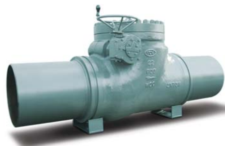
Size: 22", Class: 600 SCV API 6D Full Port Swing Check modified with lock open device.