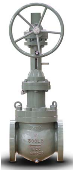
Size: 6” – Class: 300 SCV API 6D Rising Stem Ball Valve.

The patent pending SCV Valve API 6D 150# expanding gate valve has offered us avenues into markets and end user facilities given the unique design capacities and operational excellence of the valves. SCV Valve’s patent pending Rising Stem Ball Valve will allow us to capture our part of the specialty valve market. Several unique features have been engineered into this product that allow for smooth operation and inline-serviceability, including a retaining system for fast and easy seat changes.