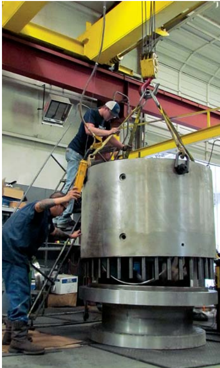
Assembling 36” 600 SCV Trunnion Mounted Ball Valve.